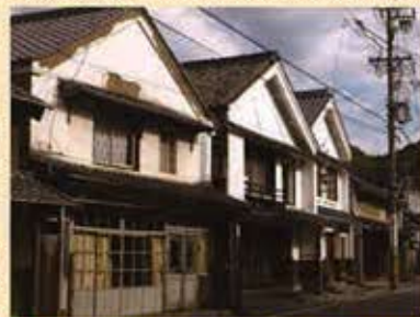
●Row of Tsumairi** style houses

However, the town of Asuke never stopped developing as the centre of the Higashikamo district in Aichi.