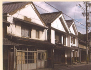
●Row of Tsumairi** style houses

However, the town of Asuke never stopped developing as the centre of the Higashikamo district in Aichi.